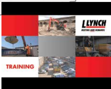
Frames from the Lynch training video

Senior management from Lynch have personally been involved with the roll out of the excavator safety exclusion zone training on site across many Skanska Civil Engineering sites, and since working with Skanska on excavator safety exclusion zones,